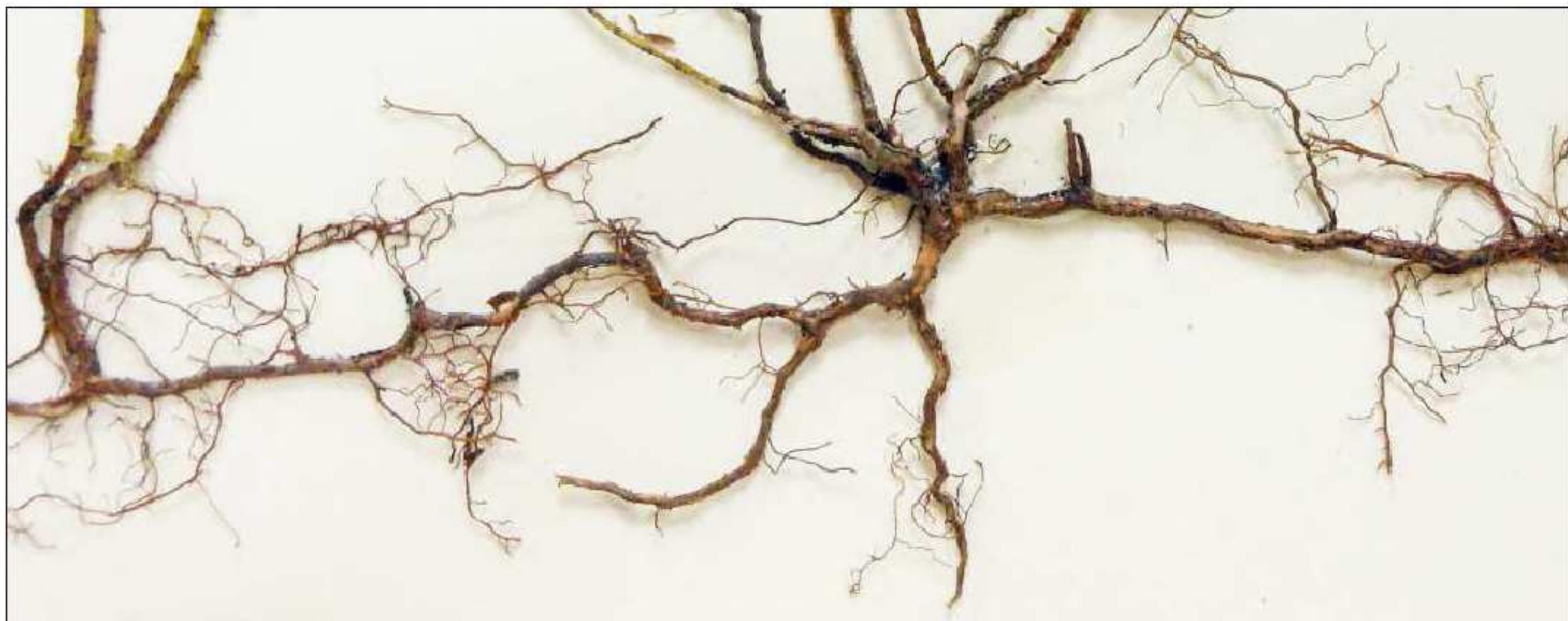
Figure 1a, b. Vegetation reproduction in Rhexia mariana var. mariana through adventitious buds from rhizome-like roots. Root tubers are not produced in R. mariana . Georgia . Wayne Co.: NW of Sterling, 16 Aug 1993, Kral 83069 (VDB).